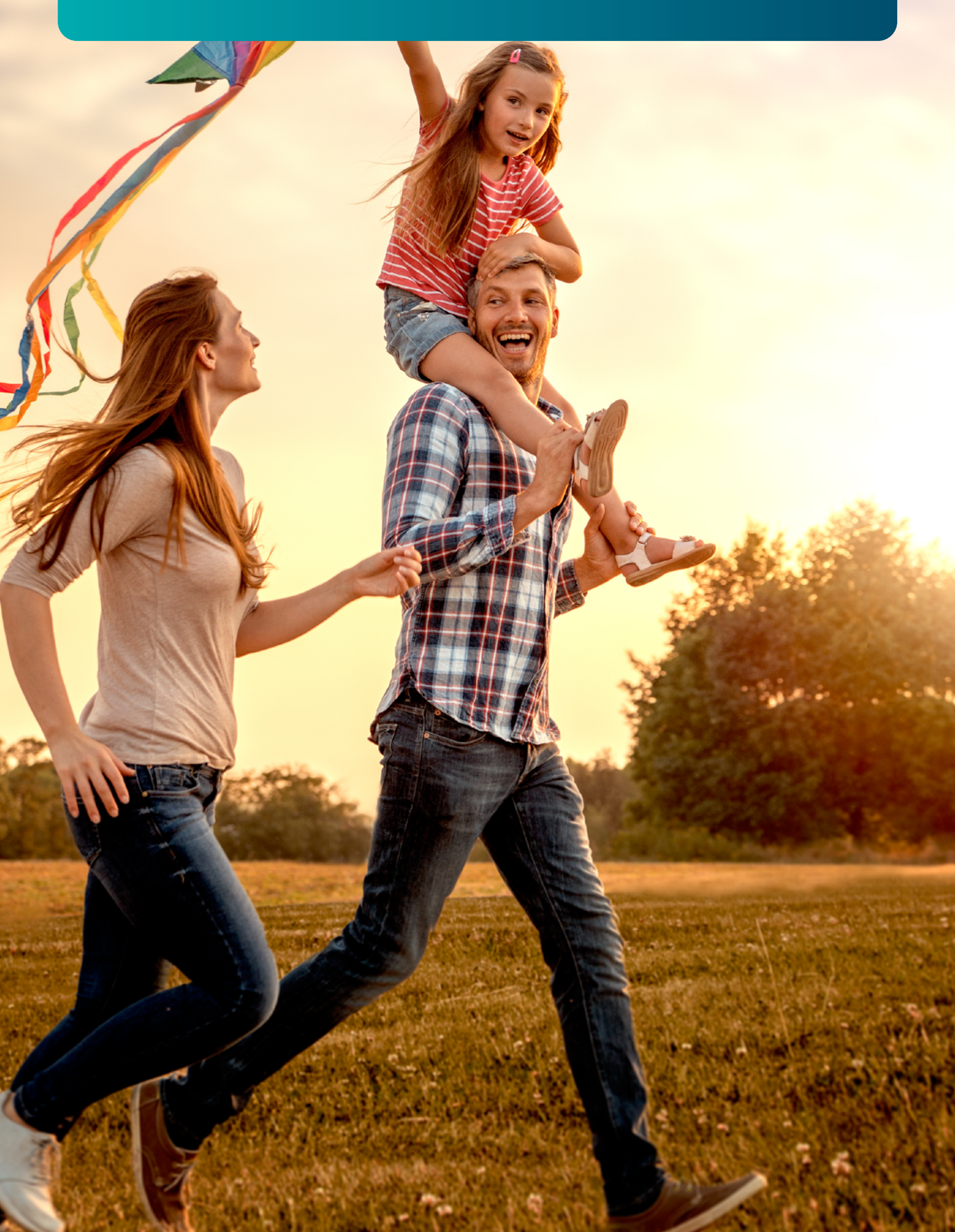
Chapter 2 Specific Objectives of the Innovative Health Initiative